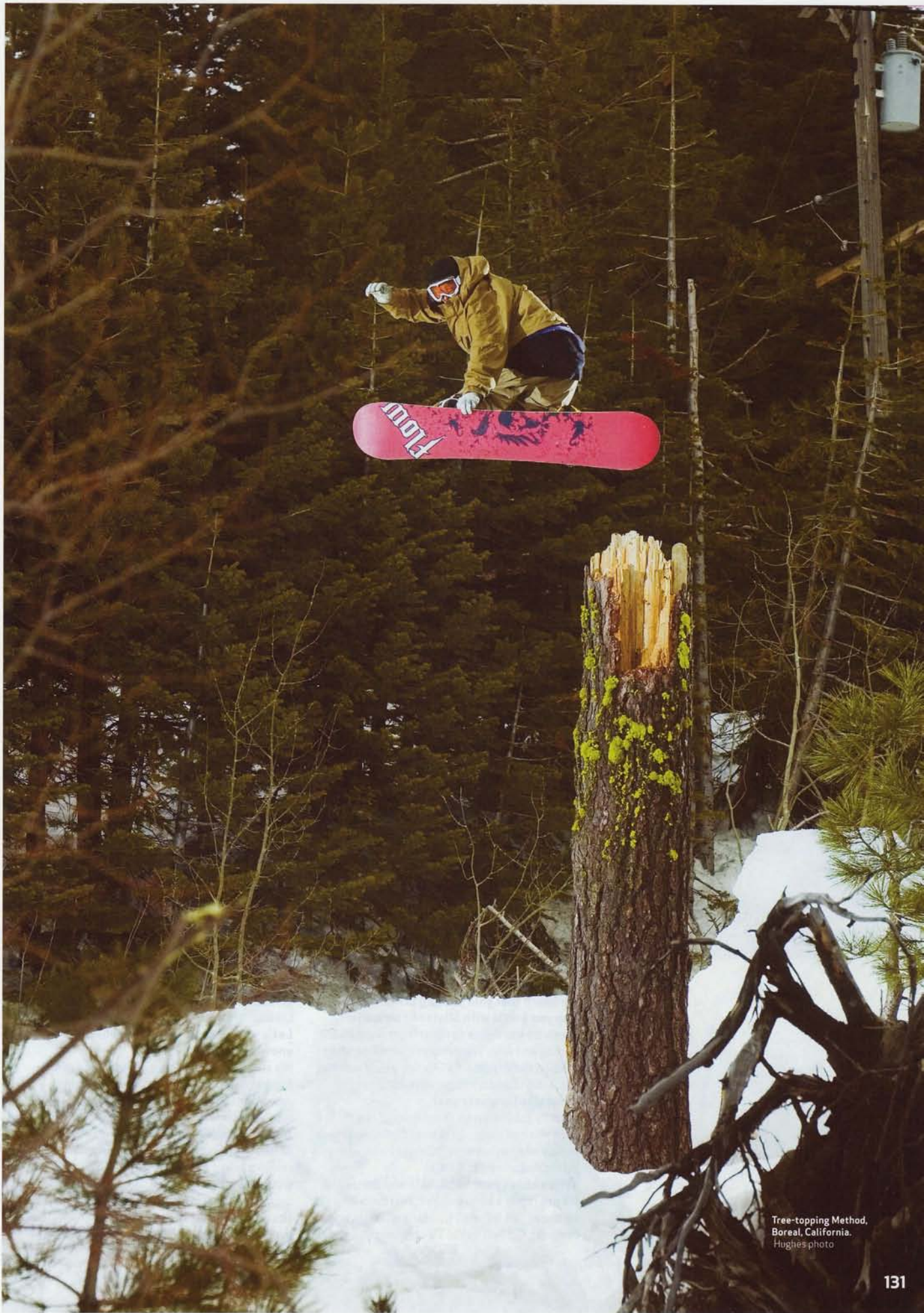
Tree-topping Method, Boreal, California.